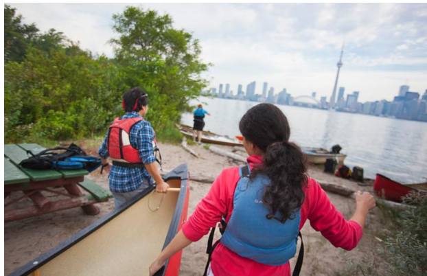
Russian Beach View

https://www.google.com/maps/d/edit?mid=z-4nC90wPbPY.kxOfKGPn-04o&usp=sharing