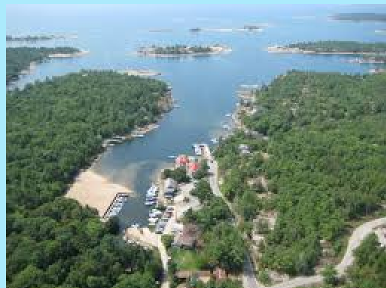
Beautiful Snug Haven Resort & Lodge on Georgian Bay

We are happy to announce our fourth annual spring training camp for sea kayakers will be held at Snug Haven Resort again on Georgian Bay. For those who are unfamiliar with Paddle Camp, it is meant to bring sea kayakers together to improve their base skills as well as get everyone into mid-season form so we can all have a nice long sea kayaking season. The event is also a great way to interact with fellow kayakers and instructors in a wonderfully relaxing setting. Click here for details.