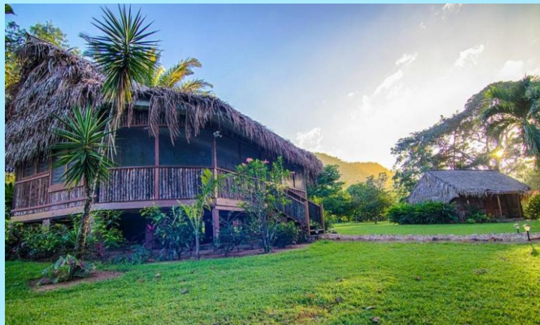
One of the Lodges we use in Belize